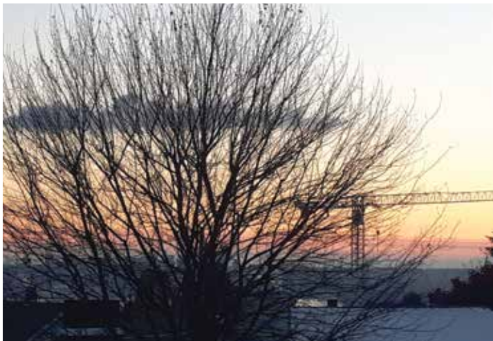
Sunset occurs behind a IUOE Local 115 crane in North Vancouver.

2023 is looking to be a busy year and I look forward to getting to know members of the companies I represent for IUOE Local 115, and assisting you in any way that I can. 🍁