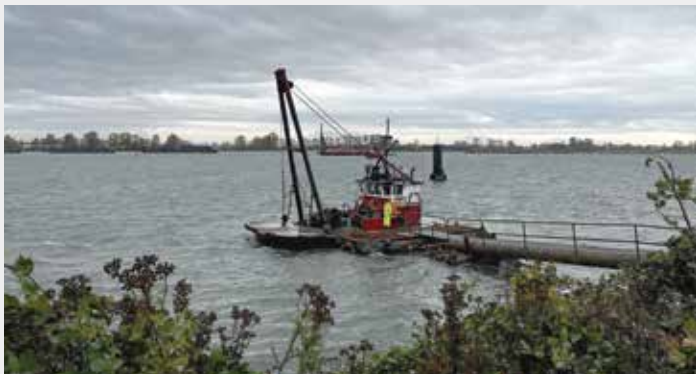
FRPD working in the Squamish Valley