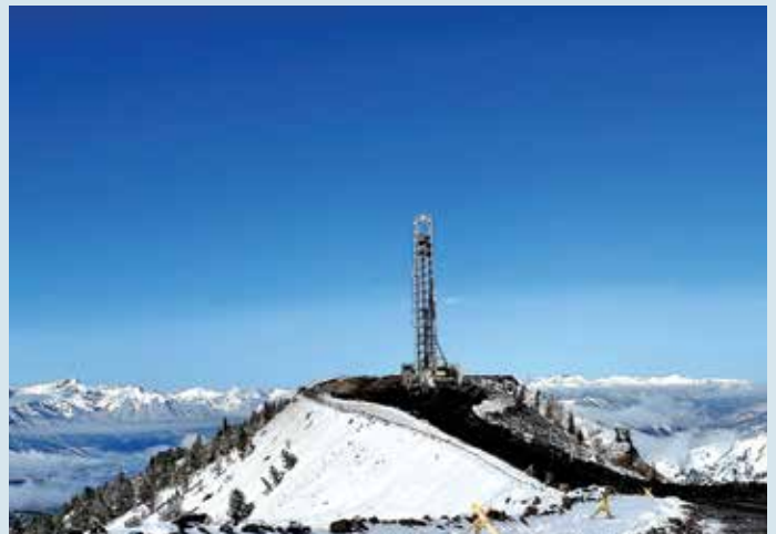
IUOE Local 115 members working at Line Creek Mine.