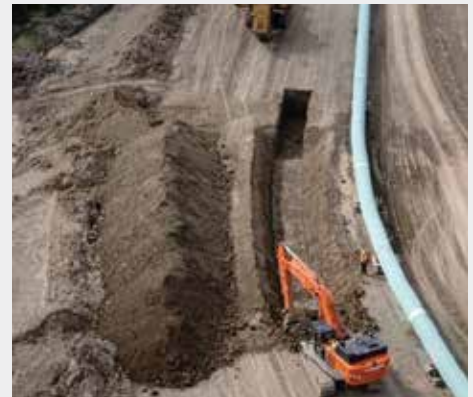
Crew working at Coastal GasLink with SA Energy.