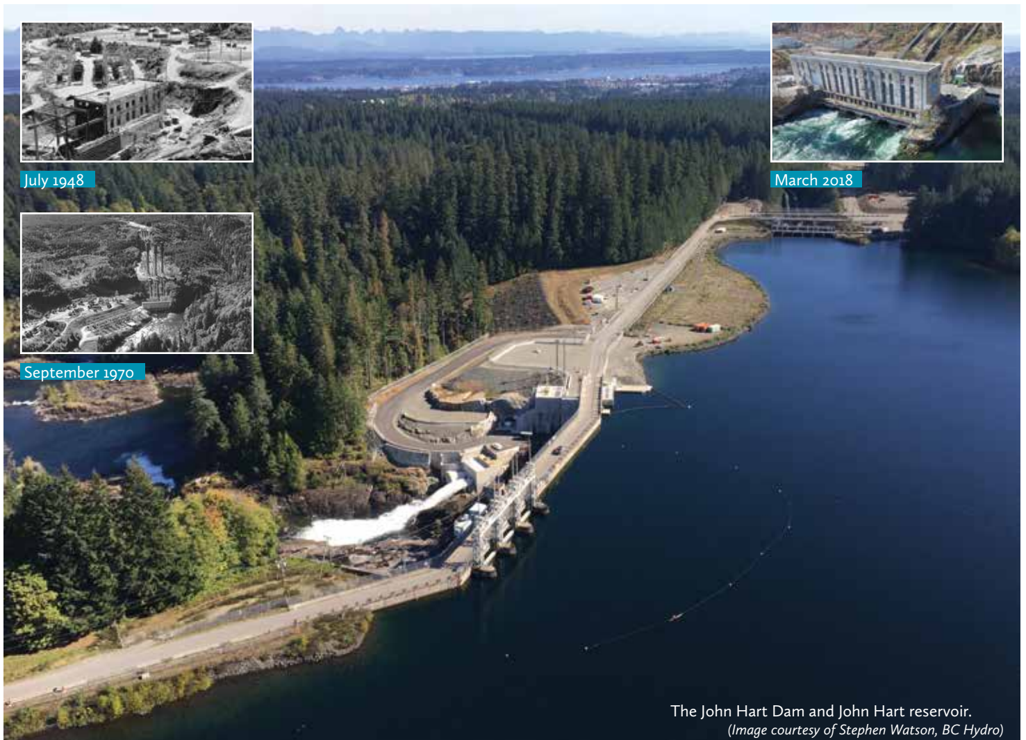
The John Hart Dam and John Hart reservoir.