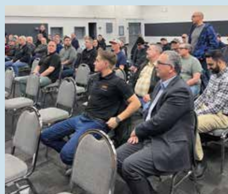
Members attend the February 2, 2023 District 1 Meeting where the 11.5% pension lift was discussed.