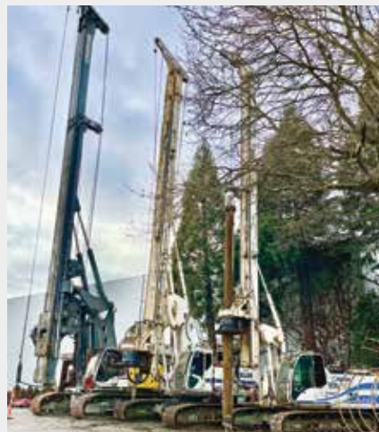
Multiple drill rigs on display at Keller Foundations during a safety training day on January 3, 2023.