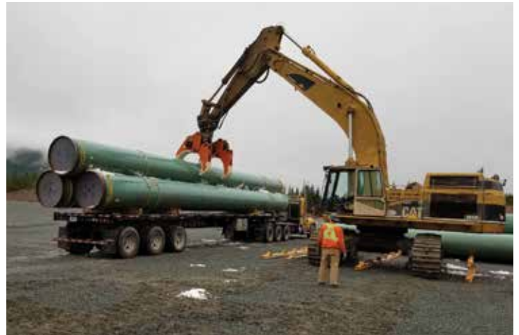
Work on the CGL pipeline will carry natural gas from Dawson Creek to the LNG Canada facility in Kitimat.

Thank you to all who have helped start this year off on the right note! 🍁