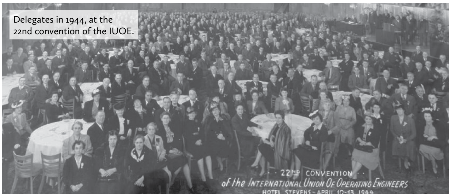
Delegates in 1944, at the 22nd convention of the IUOE.

Participation is important in any democratic organization and all members are encouraged to do their part by exercising their right to vote in electing delegates to attend the International Union of Operating Engineers' General Convention.