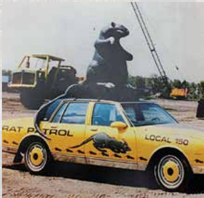
Union protest "rat" from 1989

Scabby the Rat is a symbol used by organized labour around the world to illustrate our opposition to anti-union employers and unscrupulous employer-dominated unions. You have probably seen images over the years when IUOE Local 115 has protested the poor treatment of workers in our province. What you may not know is that Scabby was invented by the International Union of Operating Engineers at Local 150 in Chicago in 1986.