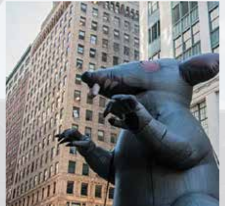
Scabby protesting in New York.