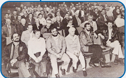
Union Meeting District 1

25th anniversary of OEPP. $134.2M in total benefit payments.