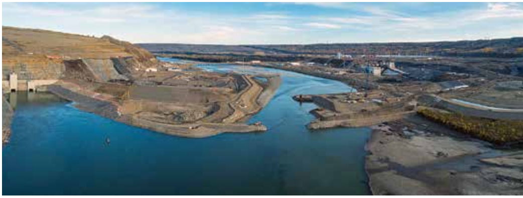
The Peace River continues to flow down the main river channel as well as through the open diversion tunnels as the rockfill berm nears completion. (October 2020)

women and other traditionally underrepresented groups receive priority access to employment and training opportunities at BCIB.