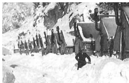
Construction workers tent camp.