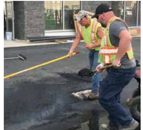
BA Dawson Blacktop working on the new Huston Development in Kamloops.