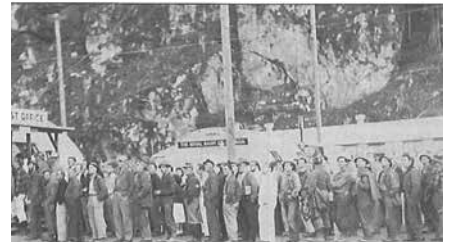
Workers line up at the post office in hope of receiving letters.

Besides rain, there is lots of snow in this area. 🍁