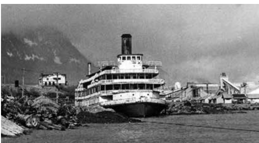
The US Navy Delta King sternwheel steamboat was converted for housing workers.