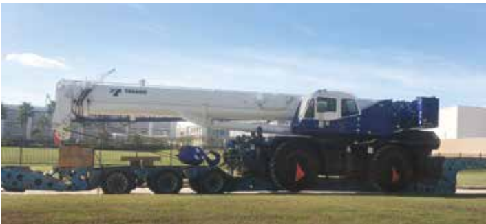
Tadano GR1000XL being loaded up to leave International Training Center in Crosby, Texas and make its way north to the IUOETA Training Campus in Maple Ridge.

These purchasing agreements are also passed on to all the local training schools across the US and Canada. Because of