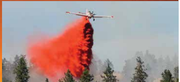
Kelowna Knox fire.