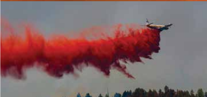
Castlegar fires attacked by Conair planes.