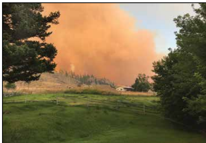
Elephant Hill Fire (Ashcroft Fire).