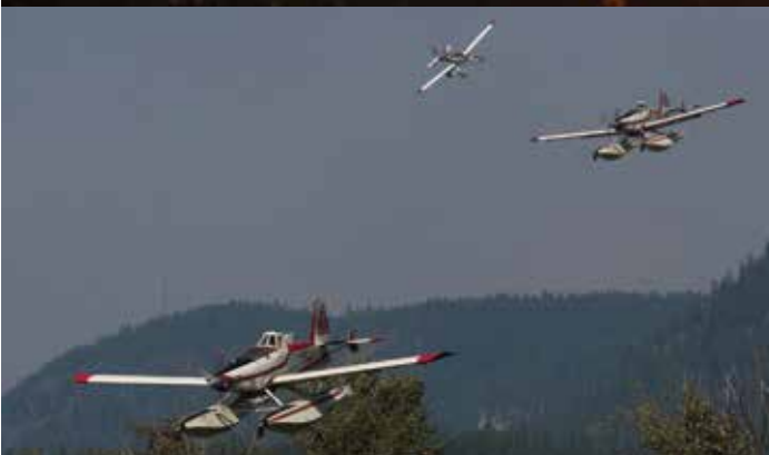
A formation of Conair Air Tractor AT-802AFs.