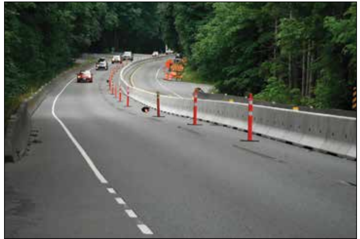
Emil Anderson Construction Inc. on the Malahat Highway.

take them into September. Advantage Crane in Nanaimo unloaded fifty of the blades at Duke Point to be transported to Cape Scott for the removal and replacement job. In the Campbell River area, Upland Excavating Ltd. has a large project at Nyrstar mine at Myra Falls calling on dispatch to fill many vacancies. Paving seems to be in full swing throughout the whole of Vancouver Island right now with all our signatory contractors running at full power, and hiring to cover their needs. Emil Anderson Construction Inc. currently has a project on the Malahat Highway that will go into 2018. OK Industries Ltd. and Global Pro System, Inc. will both play parts in the project as subcontractors. In Victoria Ralmax Contracting Ltd (RCL). has started back up at Royal Bay prepping for further expansion of the new community.