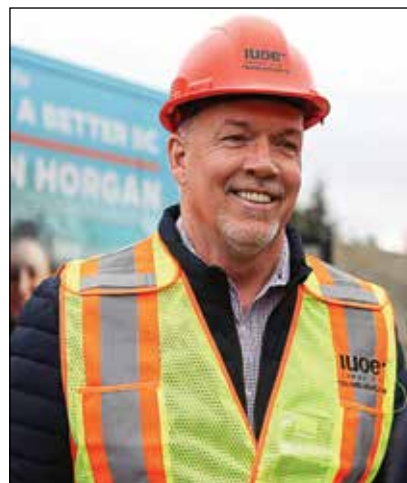
BC Premier John Horgan will be pressed by the Local for changes to the Labour Code.