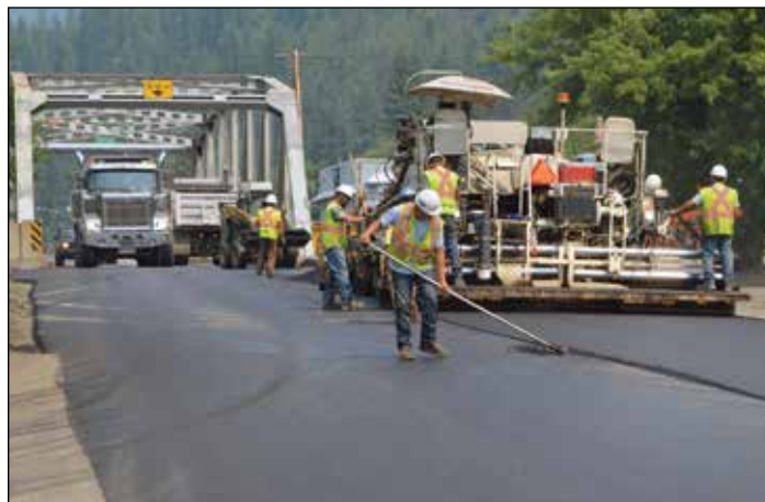
Selkirk Paving Highway Crew Paving Highway 6 in Silverton.