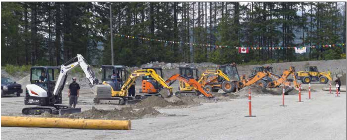
The 22nd annual IUOE Local 115 Heavy Equipment Rodeo saw over 1000 people in attendance. Many tried their hand at operating one of the 20 pieces of equipment set up under the supervision of our skilled Members.