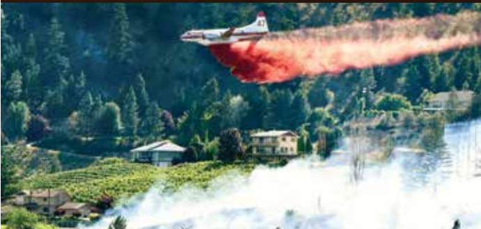
Conair's CV580 fighting the Kaleden fire.