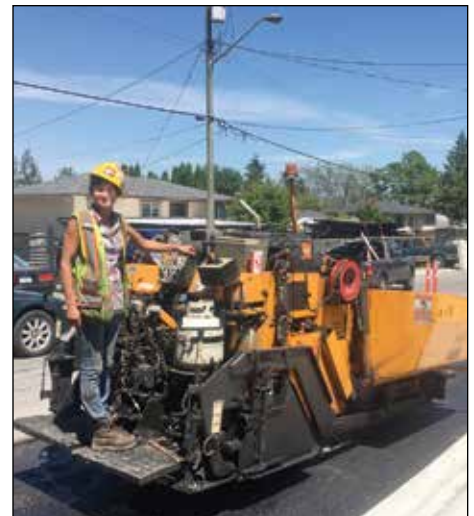
Cewe paving crew King George and 81st Ave in Surrey.