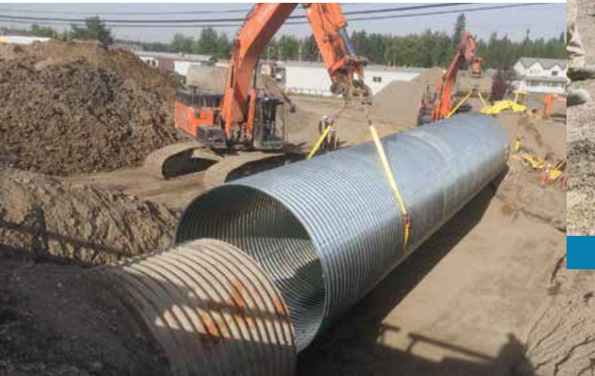
Integrated Contractors installing pedestrian tunnel.