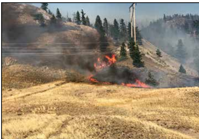
Elephant Hill Fire (Ashcroft Fire).