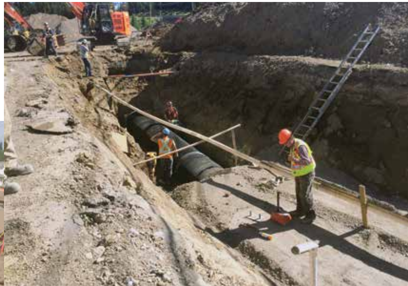
Geogrid Reinforced Slope (GRS) Wall Construction.