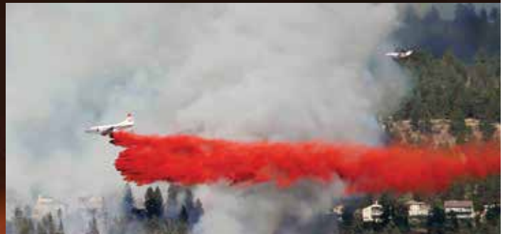
Lake Country Fire attacked by Conair planes.