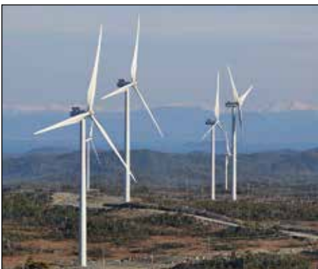
Cape Scott wind farm near Port Hardy.

Hope you had a safe summer and are ready for more to come. 🍁